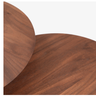
WAL: Walnut, Natural