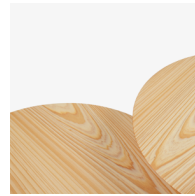
CYP: Cypress, Natural