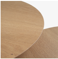
WO-N: White Oak, Natural