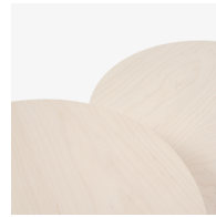
MAP: Maple, Natural