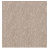
RWO-WW: Rift White Oak, whitewashed