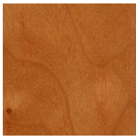
CH: Cherry, natural