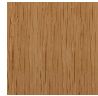
RWO-N: Rift White Oak, natural