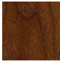
WAL: Walnut, natural