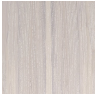
OA-WW: Olive Ash, Whitewashed