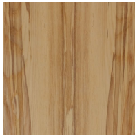
OA-N: Olive Ash, Natural