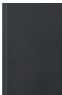
MOB: Matte Opaque Black