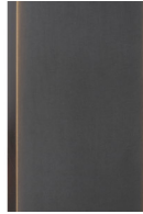
DRB: Dark Rubbed Bronze