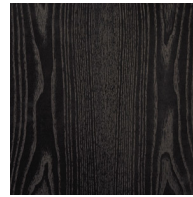
WA-E: White Ash, Ebonized