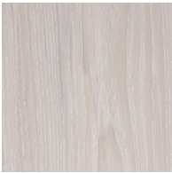
WA-WW: White Ash, Whitewashed