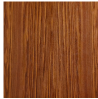
F-WAL: Walnut, Figured