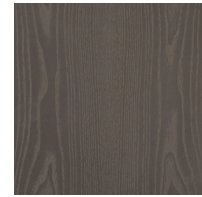
WA-G: White Ash, Grey