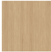
RWO-N: Rift White Oak, Natural