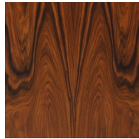
SR: Santos Rosewood, Oiled and Waxed