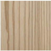
WA-N: White Ash, Natural